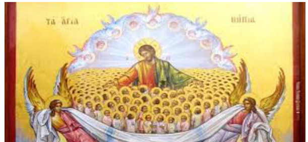
The 14000 Holy Innocents slain at Bethlehem, honoured by the Church on December 29 th as the first martyrs for Christ.